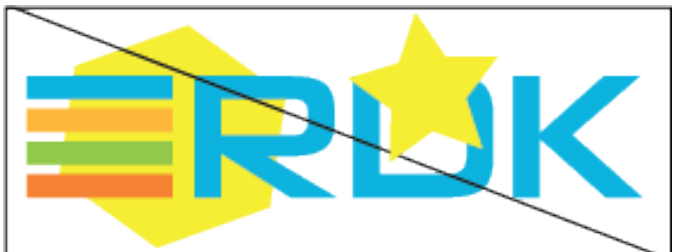
Logo cannot have overlay or underlay