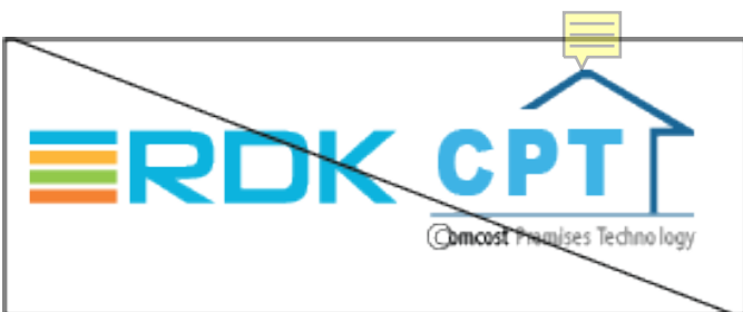
In document and PowerPoint usage - must be stand alone