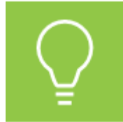
Modular design allows innovation on top of the software