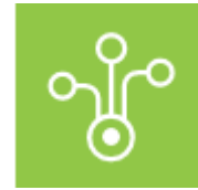
Common SoC Integration