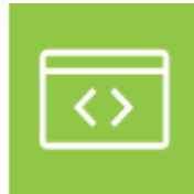
Common Software Platform