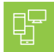
Application and services portability across technologies