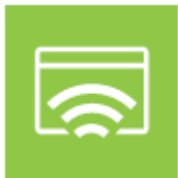
Common Apps for Broadband