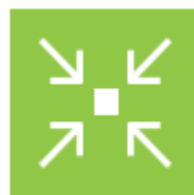
Support multiple management protocols and data models