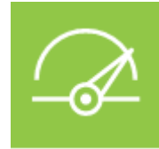
Optimized for low-to high-end devices