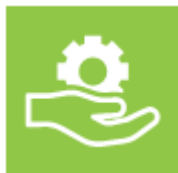
Containerization support at app layer